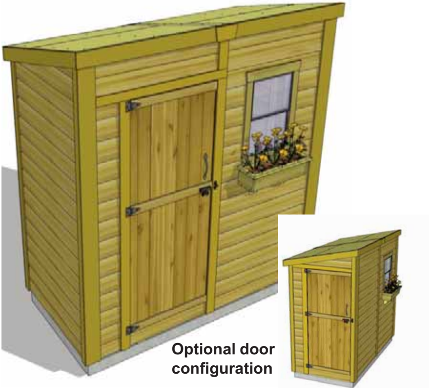
Optional door configuration

The 8 ft. x 4 ft. GardenSaver Single Door Lean-To Shed is a cute outbuilding that can be sidled up to your house or stand alone just about anywhere in and around your yard and garden